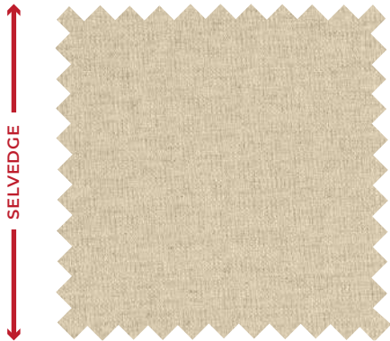
CORTEX 100 natural