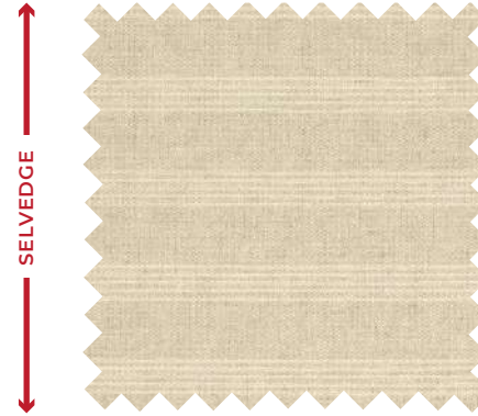
FLOEMA 100 natural