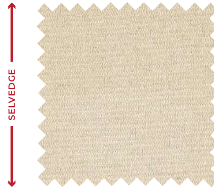
XILEMA 100 natural