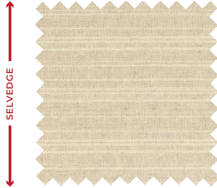
DESMA 100 natural