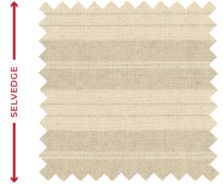
SAMAL 100 natural