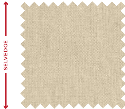
ULMUS 100 natural